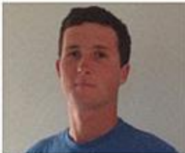
IRL James Connolly