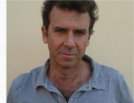
Handicap 6 Silvestre Garros